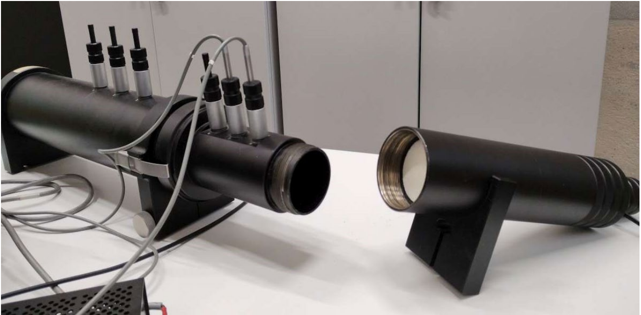
Fig. 2. An example of test piece installation in the sample tube.